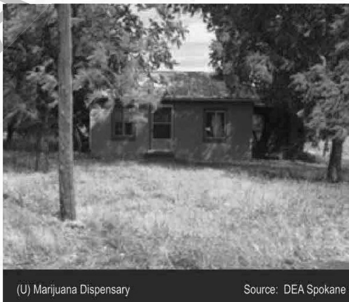
(U) Marijuana Dispensary

(U//FOUO/DSEN) In some states there is a high degree of ambiguity regarding what exactly constitutes a marijuana distribution center. For example, in Michigan there were 7,813 approved "caregiver" registrations. According to the statutory language of the Michigan Medical Marihuana Act, caregiver centers are defined as entities that are designated by qualifying patients to cultivate marijuana on their behalf and to "assist with a patient's medical use of marihuana". 3 However reporting indicates that these caregiver centers are more akin to full service marijuana dispensaries. States such as Hawaii and Nevada expressly prohibit the distribution of