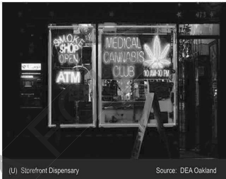
(U) Storefront Dispensary

(U//FOUO/DSEN) The number of traditional marijuana storefront dispensaries is expected to increase in the near future as more states pass “medical marijuana” legislation. However, the long term sustainability of this trend is likely to be influenced by a variety of factors. States such as California and Colorado, which currently have the most sophisticated dispensary-based systems, will be examined by states contemplating the enactment of their own “medical marijuana” laws. The diminished risk of prosecution, whether real or merely perceived, contributes to the increased number of marijuana dispensaries operating in “medical marijuana” states. The long-term fate of the current dispensary model will be highly contingent upon how effectively these states are able to regulate and control each marijuana distribution center and the impact that dispensaries have on their communities. In California, the number of marijuana home delivery services has skyrocketed in lieu of traditional storefront operations. The emergence of underground marijuana home delivery services may presage a shift to even more legally ambiguous methods of dispensing the drug in new “medical marijuana” states.