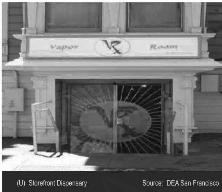
(U) Storefront Dispensary

Health is responsible for administering its Medical Marijuana Program (MMP). This program is a strictly voluntary identification card issuance and registry system for users that imposes responsibilities at both the state and county level. Under this plan, the California Department of Health administers the Medical Marijuana Identification Card Act (MMIC) only, while dispensaries, growing collectives, etc., are monitored through local city or county business ordinances and the regulatory authority lies with the State Attorney General's office. 2 However, there is no statewide tracking agency in California to account for the growing number of marijuana dispensaries or to monitor compliance with state/county guidelines. According to Drug Enforcement Administration (DEA) sources, there are at least 124 marijuana dispensaries operating in the San Diego region and more than 500 documented storefront dispensaries in Los Angeles.